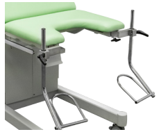
↑ Leg rests

Universal holders for easy fixing / releasing