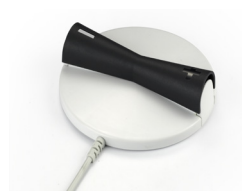
↑ Foot pedal