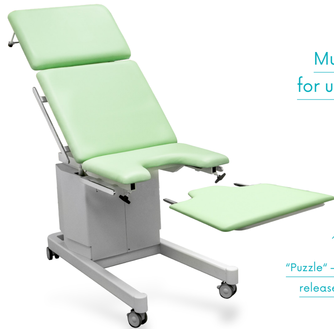
↑ "Puzzle" – easy to release / fix

Multipurpose examination couch – solution for urology and gynaecology, USG scanning, X-ray images