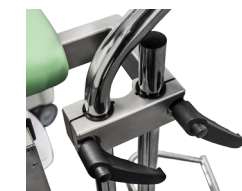
↑ Lever II.