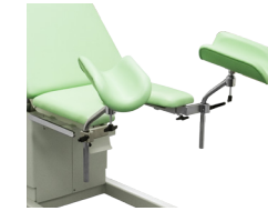
↑ Leg supports