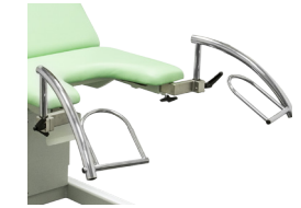
↑ Leg supports