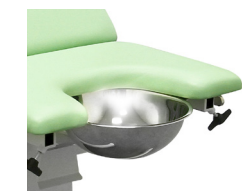
↑ Stainless bowl