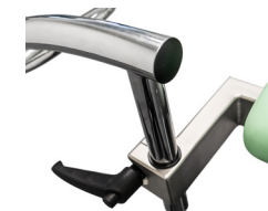
↑ Lever I.

Universal holders for easy fixing / releasing