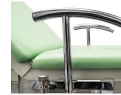
↑ Hand rests

Wide range of supports for urology and gynaecology examinations